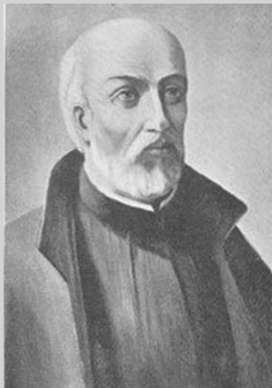
St. John de Brebeuf